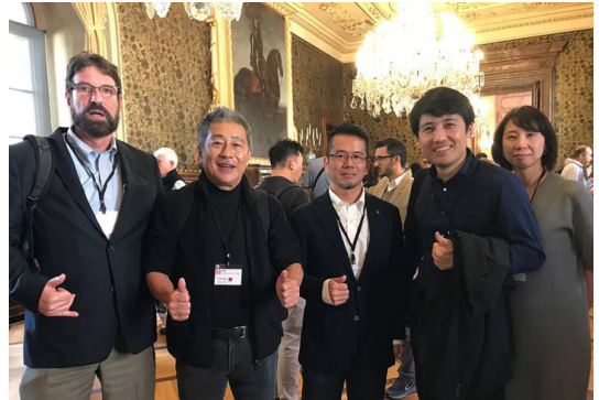
AIA Japan members at the IR Conference, Prague.