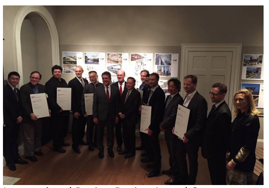
International Region Design Award Ceremony.