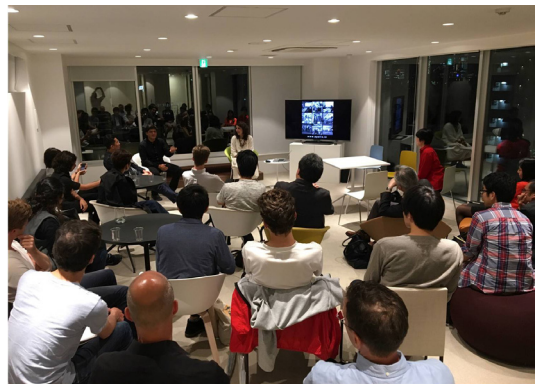
Opolis Architects, Mumbai at Arper showroom.

Overseas events included the Grassroots Conference in Washington, DC (February), the National Convention in Orlando (June), and the International Region Conference in Prague (October). At the IR conference, it was officially announced that Canada has been officially sanctioned as 7th Chapter of the IR (the other 6 are Japan, Hong Kong, Shanghai, Great Britain, Continental Europe, and Middle East). Future IR Chapters in our part of the world may include Singapore and Korea. The UIA Conference Seoul was held in September, with half a dozen AIA Japan members in attendance.