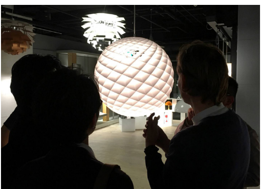
Øivind Slaatto at Louis Poulsen showroom.