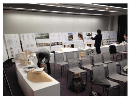
Presentation of student's works at Takenaka Corporation Headquarters Building.