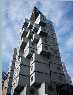
The Nakagin Capsule Tower, Ginza, 1972

Kurokawa was an honorary AIA member, friend and supporter of AIA - Japan. We express our sincere condolences to his family.