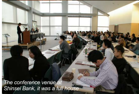
The conference venue at Shinsei Bank, it was a full house