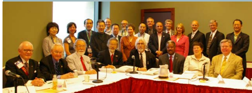
AIA & JIA Members meeting at the National Conference, San Antonio, TX